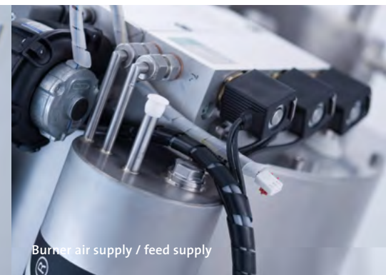
Burner air supply / feed supply